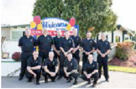
Members of the WI Army National Guard 120th Field Artillery pose for a photo before volunteering as the valets at the 2016 Auction of Champions event.