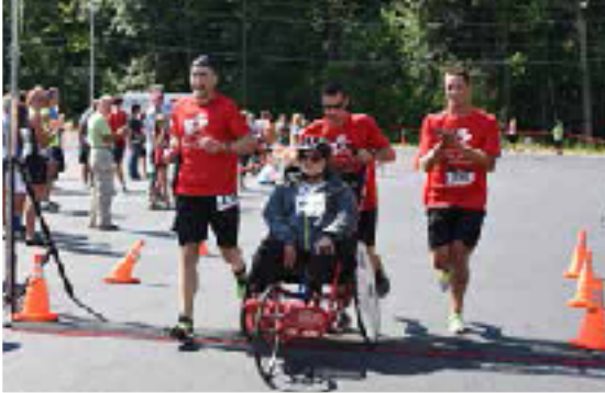
Members of myTEAM TRIUMPH cross the finish line at the 2016 Hub City Days Duathlon.