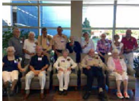
The 2016 Milestone Birthday Celebration honorees pose together before digging into the cake and ice cream.