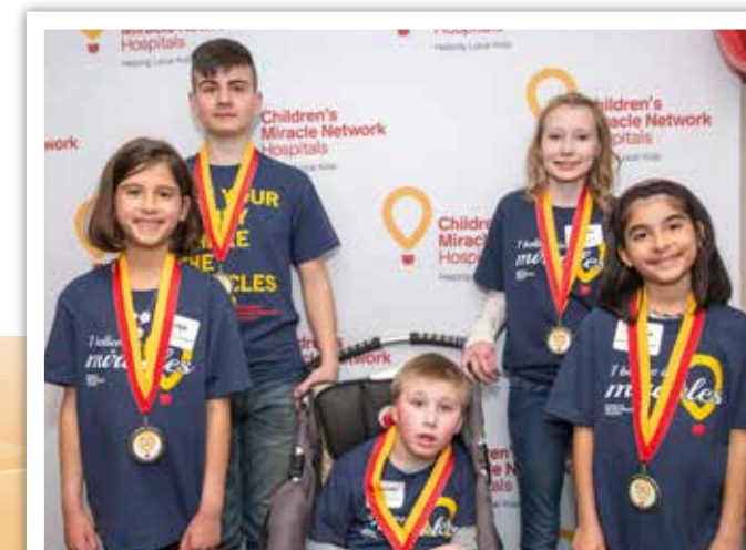
Our 2018 Children's Miracle Network Hospitals Miracle Children.

Children's Miracle Network (CMN) Hospitals' local and national partners gathered to celebrate 2017 fundraising efforts, discuss best practices and experience the mission firsthand through spotlight tours of Marshfield Children's Hospital.