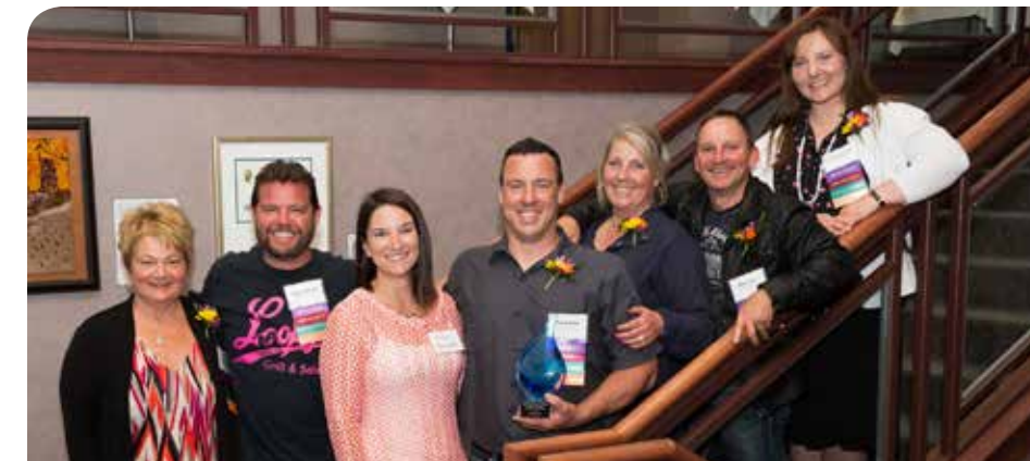
Ridin' for a Reason – Outstanding Volunteer Fundraiser.