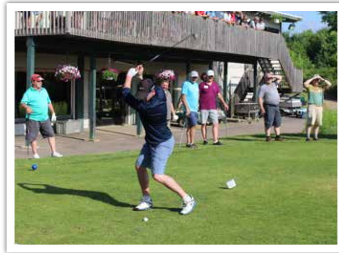
Fore the Kids raised funds this year for Marshfield's first mental health patient navigator.

Thirteen years and $1.5 million after its founding, the Steven Meissner Memorial Classic “Fore the Kids” continues to promote youth initiatives and keep the memory of a beloved community member alive.