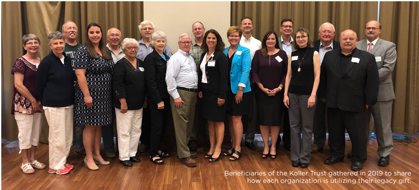
Beneficiaries of the Koller Trust gathered in 2019 to share how each organization is utilizing their legacy gift.