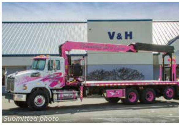
Submitted photo V&H Pink Truck

Gypsum Management and Supply (GMS), based in Tucker, Georgia, offered the more than $500,000 winning bid.