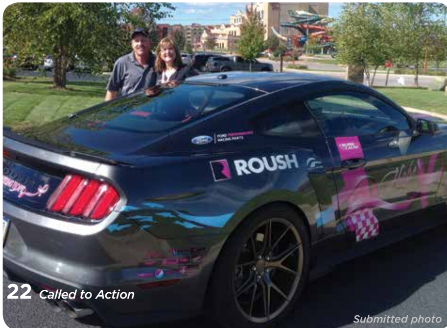
22 Called to Action