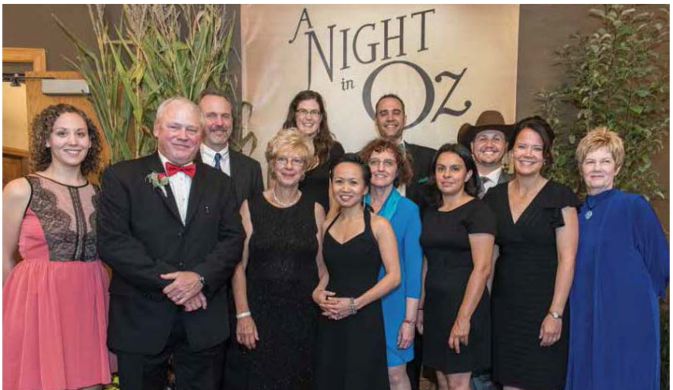
National Farm Medicine Center staff at the 2015 Auction of Champions