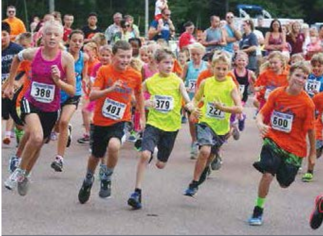
Young athletes rush from the starting line at the first ever Kids Duathlon