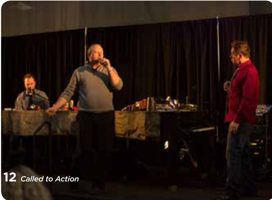
12 Called to Action